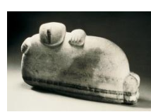
Latcholassie Akesuk Spirit Stone carving, 1978