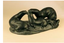
Abraham Irqu Niaqu 3 Otters Fighting For Fish Stone carving, 1965