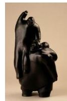
Peter Sevoga Family - 3 Figures Stone carving, 1971