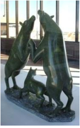
Pitseolak Niviaqsi Caribou Protecting Young Stone carving, 1997