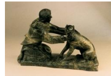
Oviloo Tunnillie Woman with Dog Stone carving, 1990