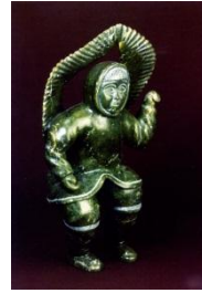
Lukta Qiatsuk Man with Wings (Angel) Stone carving, 1989