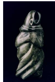
Osuitok Ipeelee Human/Fish Praying Stone carving, 1978