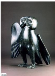
Lukta Qiatsuk Owl/Man Stone carving, 1988