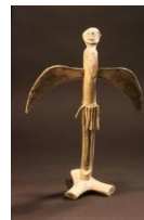
Luke Iksiktaaryuk Flying Shaman Stone carving, 1974