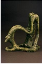
Turataga Ragee 2 Heads/Braids Stone carving, 1990