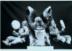
Luke Airut Owl Lifting Drum Dancers Bone Carving, 1980