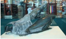
Putuguk Ashevak Sedna with Sea Mammals Stone carving, 2001