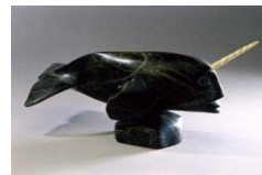
Novoala Alariaq Narwhal Spirit Stone carving, 1987