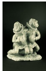
Luke Airut Cheek Pull Stone carving, 1991