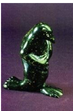
Towatuga Sagouk Human/Bird/Seal Stone carving, 1972