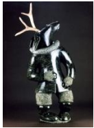
Iola Abraham Ikkidluak Human/Caribou Stone carving, 1990