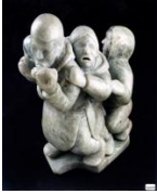
James Ungalaq Starvation Stone carving, 1991