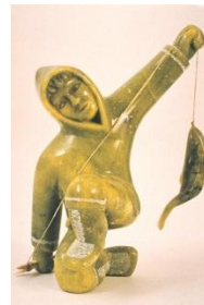
Isaaci Etidlooie Ice Fishing Stone carving, 1997