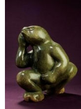
Kiugak Ashoona Thinkier/Transformation Stone carving, 1980