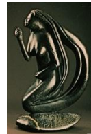
Abraham Ruben Sedna Stone Carving, 1989