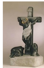
Thomassiapik Sivuarapik Crucifixion (Jesus/2 Marys) Stone carving, 1992