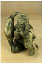
Lipa Pitsiulak Hunter with Seal/Thanksgiving Stone carving, 1980