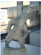
Simeonie Aqpik Bear Baseball Pitcher Stone carving, 1991