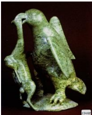
Eegyvudluk Pootoogook Falcon with Rabbit Stone Carving, 1990