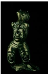
Davie Atchealak Figure with Faces Stone carving, 1980