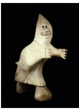
Karoo Ashevak Shaman Bone Carving, 1969