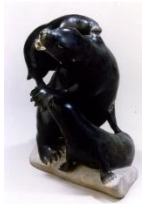
Juanasie Itukala Bear Fighting Two Seals