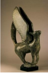
Kububuwa Tunnillie Dog Spirit (Transformation) Stone carving, 1991