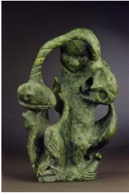
Osuitok Ipeelee Composition Stone carving, 1978