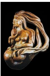
Abraham Ruben Sedna Stone carving, 1990