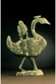
Osuitok Ipeelee Man Standing/Riding on Bird Stone carving, 1979