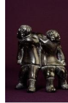
Unidentified Cheek Pull Contest Stone carving, 1960