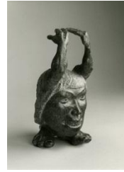
Davie Atchealak Spirit Being/Face Torso Stone carving, 1989