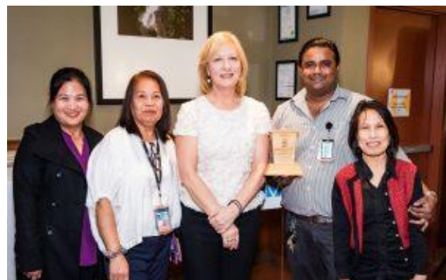
Figures 2 and 3. Tenants are awarded for first, second, and third place prizes in each external Waste Wars competition. There are six total winners, as Restaurants and Quick Service are separated. 2018.