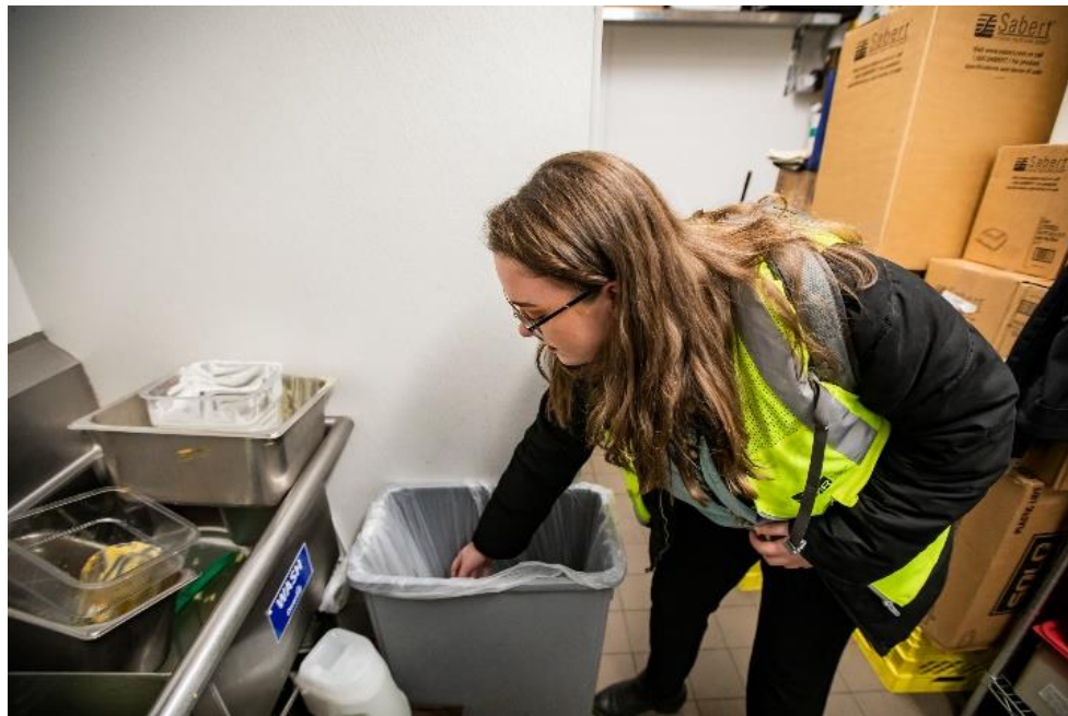
Figure 9. During Waste Wars, Environment team members go into kitchens to check each bin.