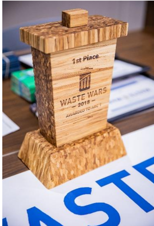
Figure 10. ChopValue trophy.