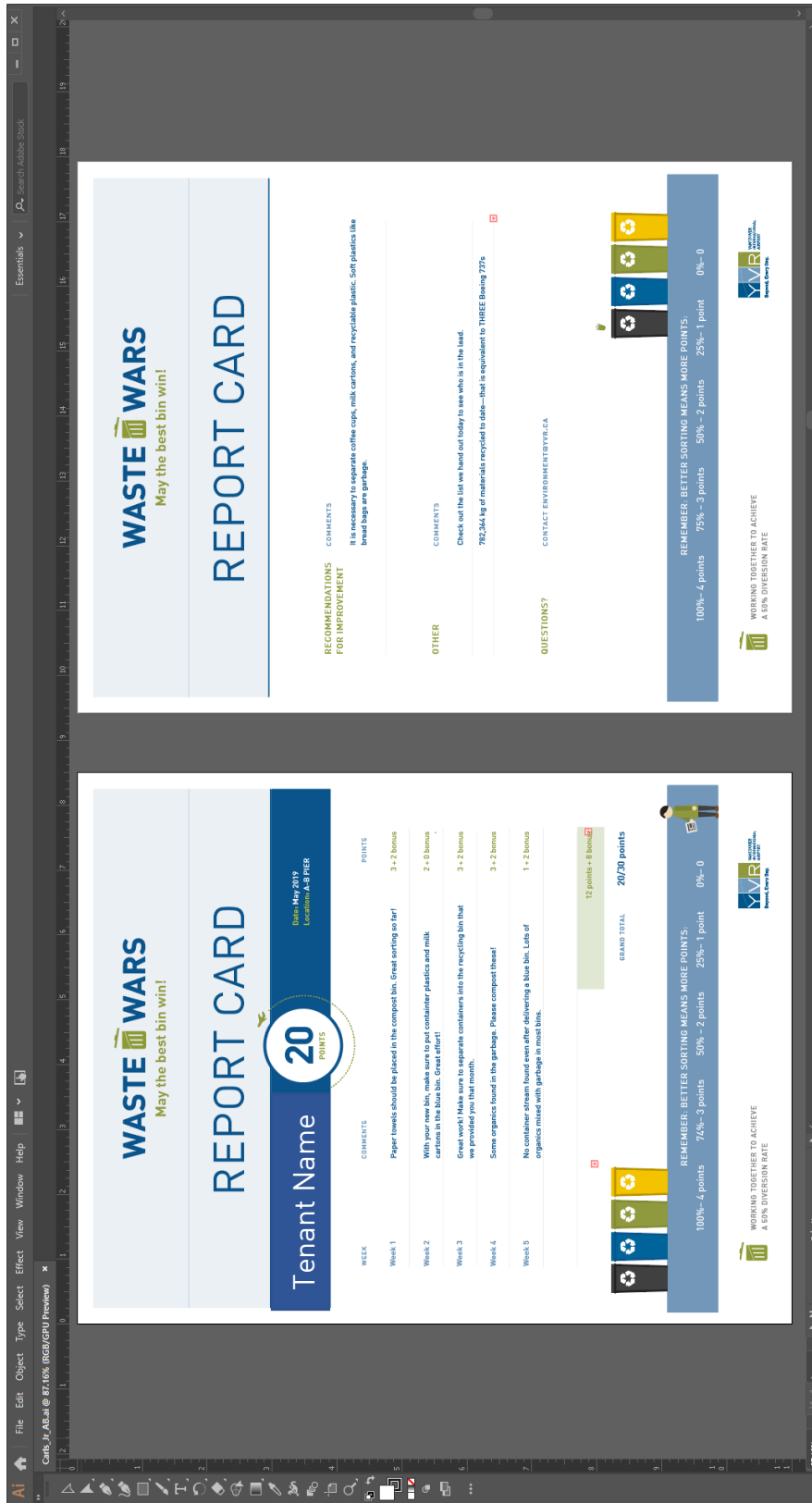
Figure 7. Sample report card.