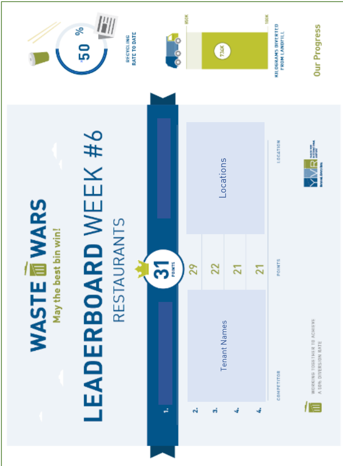
Figure 5. Sample Leaderboard for Waste Transfer Rooms.