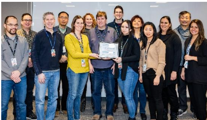
Figures 11 and 12. One of the winning teams of YVRAA employees (left) and members of the Environment Department (right). February 8 th, 2019.

Teams were assigned based on proximity to designated common-use waste stations in the office. They were each graded based on sorting into the four streams: Garbage, Containers, Paper, and Compost. The task overall is monitoring waste, educating peers, and trying to win this friendly competition. All staff were automatically enrolled in the program, and representative leaders were chosen to award points on how well sorting was being done. In addition, they answered trivia questions to gain extra points!