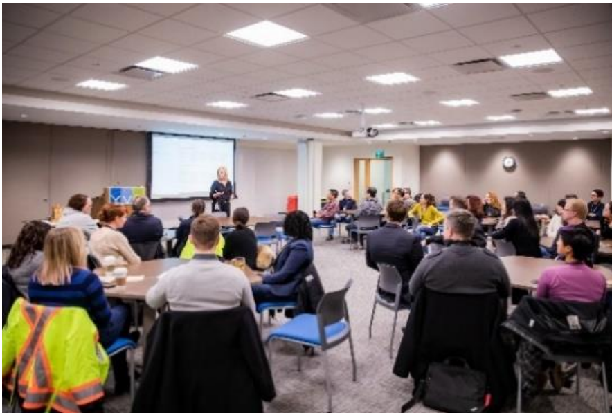
Figures 15, 16, and 17. Winning team members from the internal Waste Wars competition were awarded with gift cards and a trophy on February 8 th , 2019.